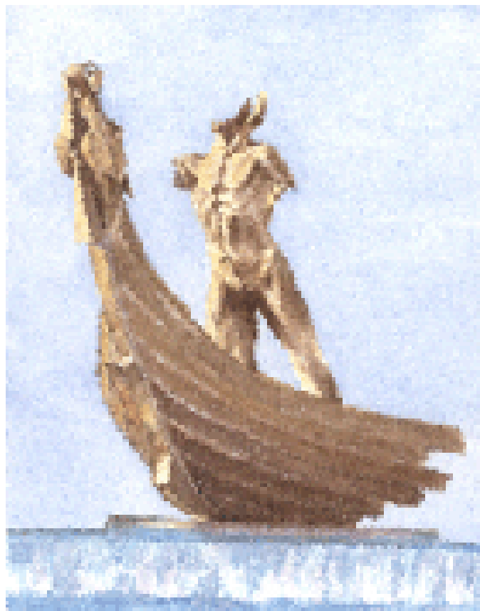
'El Fenicio in Crystal' . Watercolour after manipulation in Photoshop for entry into 'digital art' competition.

piece, that I had painted. If I started with what I understood as art, then Adobe Photoshop or Elements, could add the 'digital' part. I selected 'Filter' in the menu and 'pixelate' made me smile - I was thinking of pixelated and that I probably was crazy entering any competition to do with computers. But after some experimentation, changing the square pixels to crystal-shaped using 'crystallize' produced a pleasing image. I titled it 'El Fenicio in Crystal' . My first mixed media (watercolour and digital imaging) and impressionistic work! It was exhibited on the group's web site and it won second prize!