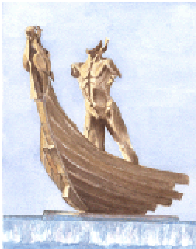
'El Fenicio' . Original watercolour 17 x 22 cm (6.75 x 8.75 ins). On Arches Paper (Not) 300gsm.

I believe understanding the traditional artistic skills is essential, to produce good artwork. However, the more I paint, the more I find my computer and related gizmos invaluable in the creative and learning process. They are also useful to produce high quality, long-lasting prints and greetings card of one's own artwork.