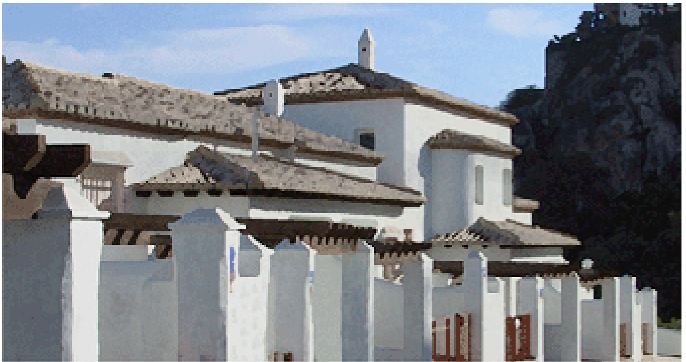
Manipulated image with the unwanted details removed using the Rubber Stamp Tool. The dark gate post where the reflected light was obstructed by a vehicle has been lightened.

these will vary depending on the subject. Here I settled on 'Brush Size' - 1, 'Brush Detail' - 10, 'Texture' - 1; then repeated it. I liked this amount of manipulation.