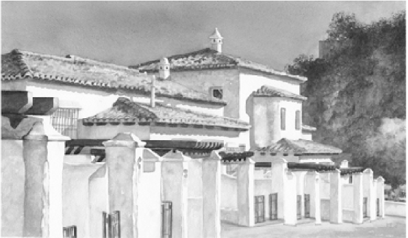
Finished painting in monochrome, to check the tonal values.

The gates were painted last, green replacing the red primer seen in the photograph. My brushes were both rounds, a No. 12 Red Sable and No. 10 Designer Point Synthetic.